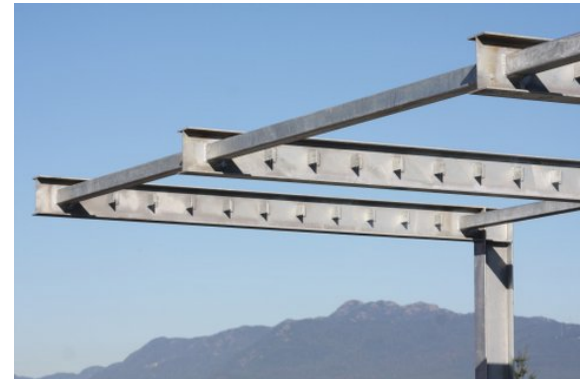
Stratford School Canopy