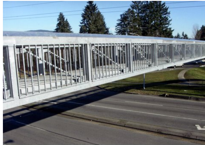
Port Coquitlam Pedestrian Overpass