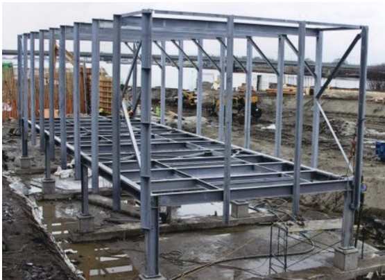
Richmond Oval Mechanical Building