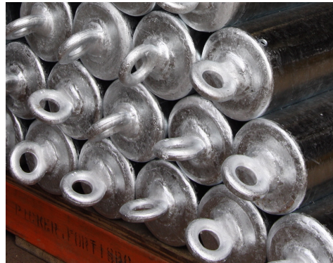
Safety Pipe Supports