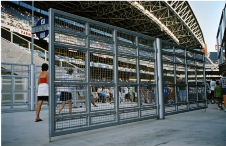
Qwest Field Entrance Gate Seattle