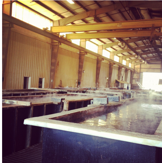
Cleaning tanks in facility