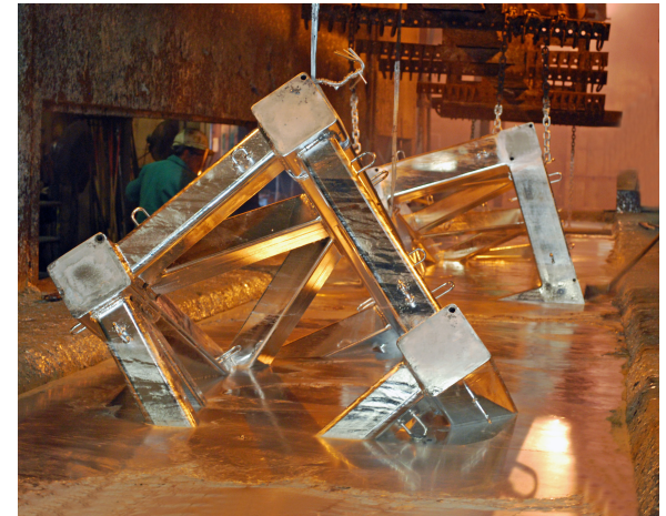
Galvanized products being removed from zinc