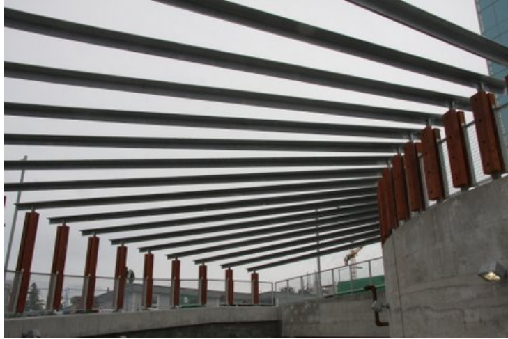
Surrey Memorial Hospital Trellis