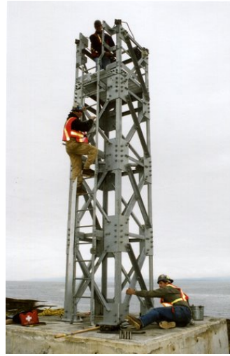
Radio Tower, Hornby Island