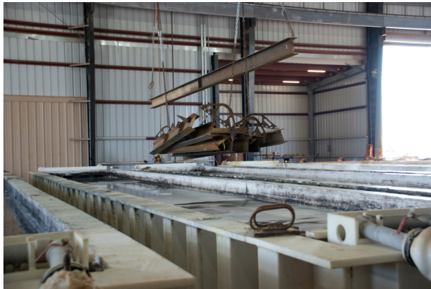
Cleaning customers products