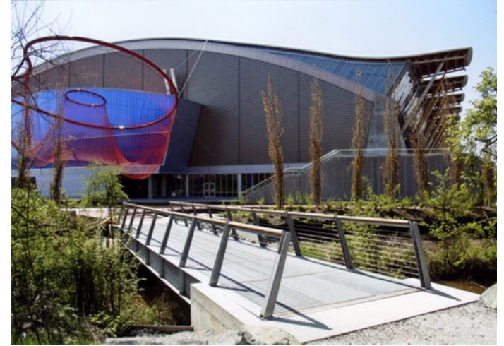
Richmond Oval Galvanizing and Powder Coat